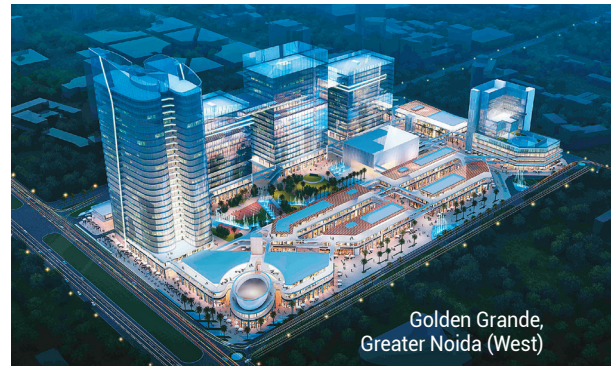
Golden Grande, Greater Noida (West)

As this segment gains prominence as a transformative factor in India's real estate landscape of late, numerous key regions across the country are experiencing a surge in such projects, presenting attractive prospects for all stakeholders involved.