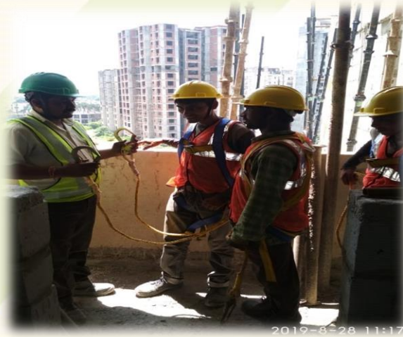
Height Work Training for Workers