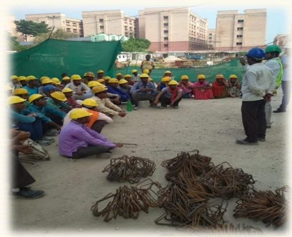
Morning Pep Talks with Workers