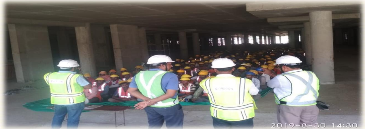
Safety Talk Training for Workers