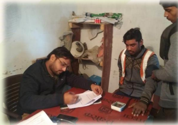
Medical Camp for Workers