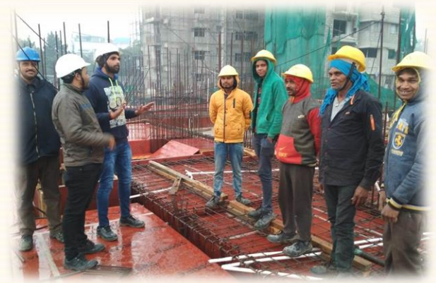
Morning Pep Talks with Workers