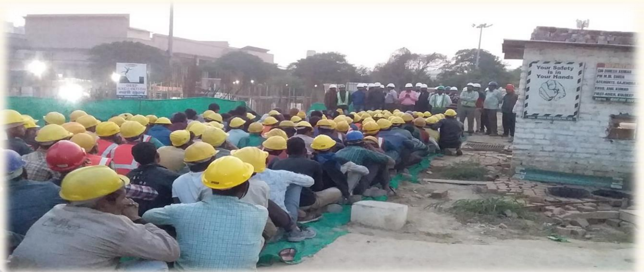
Safety Talk Training for Workers