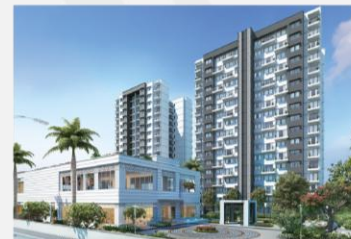
EXPERION CAPITAL Gomti Nagar, Lucknow