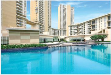
windchants | NOVA SECTOR-112, GURUGRAM