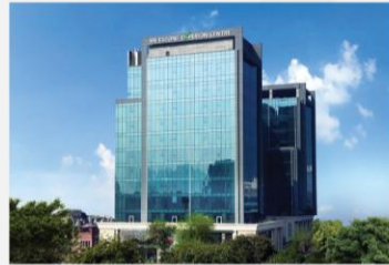
MILESTONE EXPERION CENTRE NH-8, Gurugram