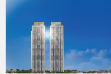
EXPERION Elements SECTOR-45, NOIDA