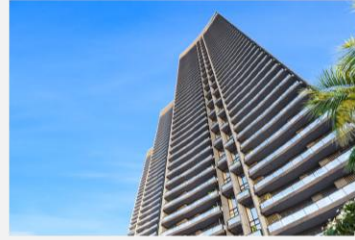
THE TRILLION SECTOR 48, GURUGRAM