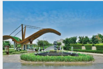
THE WESTERLIES LIFE NEEDS SPACE Sector-108, Gurugram