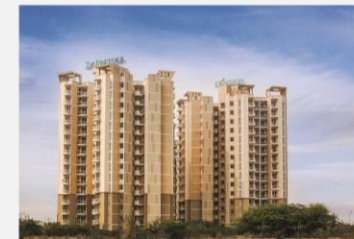
The Heartsong Sector-108, Gurugram