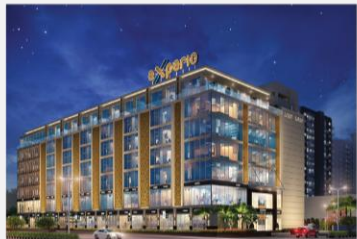
experio @ Experion Capital Gomti Nagar, Lucknow PH 1 BERA REGN. NO. UPRERAPR04224 WWW.UP-RERA.IN