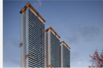
SAATORI YOUR INNER PEACE Sector 151, Noida