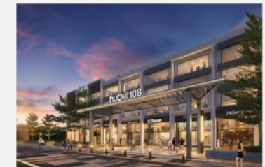
hub@108 Sector-108, Gurugram