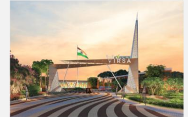
EXPERION VIRSA GT Road, Amritsar